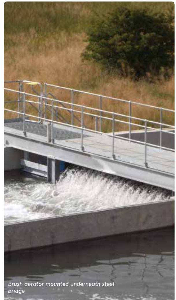
Brush aerator mounted underneath steel bridge

As a leading manufacturer of aeration systems, we have developed two brush aerators designs, the Landustrie 700 and Landustrie 1000, giving you greater choice for aeration, mixing and propulsion.